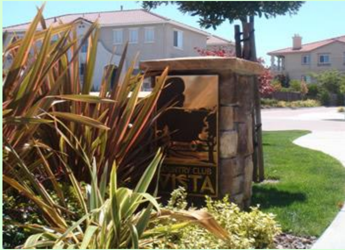
Entrance to our community